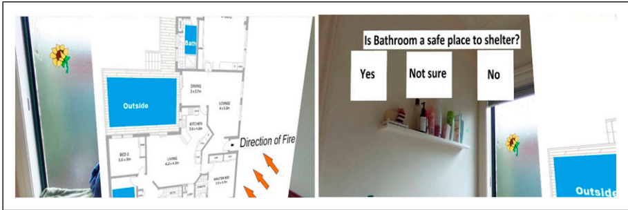
Figure 3. An activity to identify a suitable place to shelter from bushfire followed by feedback.

Embedded Survey. A survey at the end of the learning tool consisted of six Likert-scale questions ranging from 1 (strongly disagree) to 5 (strongly agree) that investigated students' perceptions of their accomplishment within the learning environment, the value of the learning experience and the transferability of the acquired knowledge to a real-life situation.