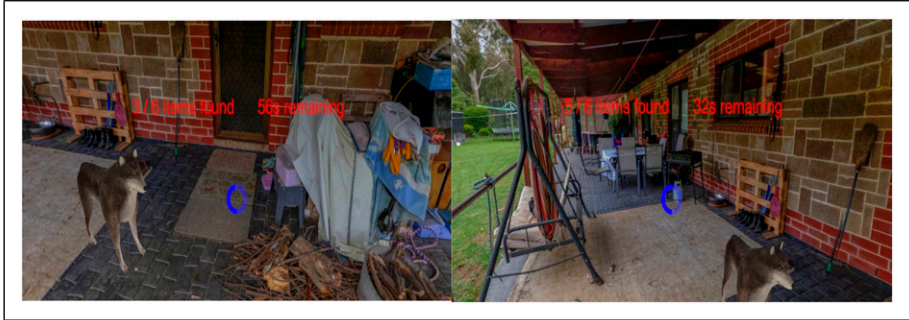
Figure 2. An activity to identify six flammable items in the backyard followed by feedback.

appropriate location is provided and feedback stresses why in different scenarios one area might be safer than another. Figure 3 depicts VR scenes related to the sheltering activity which was designed to assess students' ability to apply knowledge as an element of a lower order thinking.